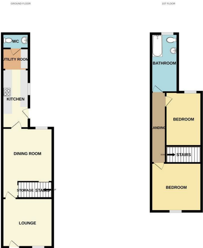
38 RECREATION STREET, LONG EATON

Whilst every attempt has been made to ensure the accuracy of the floorplan contained here, measurements of doors, windows, rooms and any other items are approximate and no responsibility is taken for any error, omission or mis-statement. This plan is for illustrative purposes only and should be used as such by any prospective purchaser. The services, systems and appliances shown have not been tested and no guarantee as to their operability or efficiency can be given. Made with Metropix (2020)